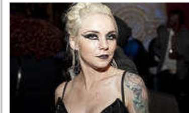
mr. BLACK 'Black Swan' Release Party @ Bardot