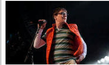
Weezer @ Gibson Amphitheatre