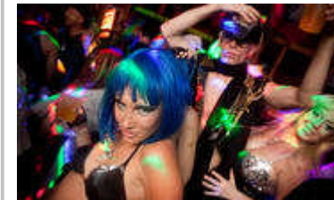
November '10 Month in Photos